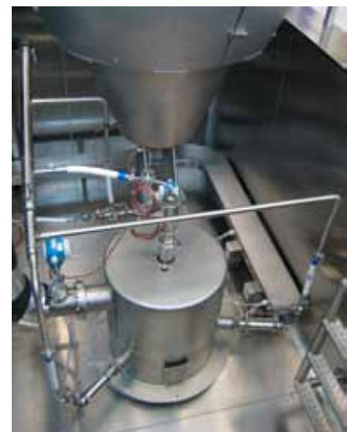
The bottom of the spray drying chamber and top of the cyclone are placed in a technical area