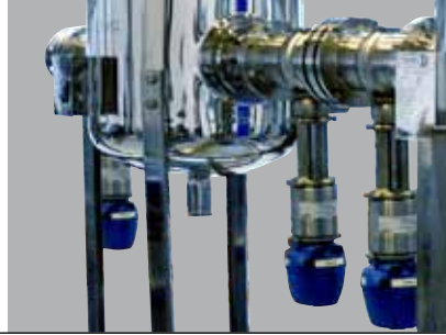
Detail from the exhaust filter arrangement