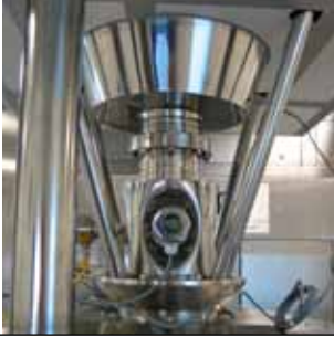
Sterile powder from the cyclone is discharged in a clean room