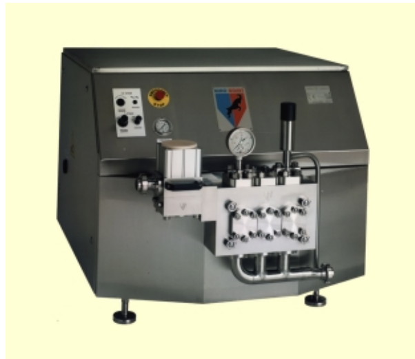
Energy Series Microsizer

The principle of the very high pressure Microsizer involves pumping of the premix (powder, oil, water, additives, other) through a narrow orifice (micronizing valve) under