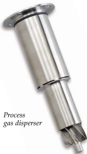
Process gas disperser

The SDMICRO™ Spray Dryer is designed for two-fluid nozzle atomization and drying of small volumes of high value pharmaceutical, chemical and food & dairy formulations.