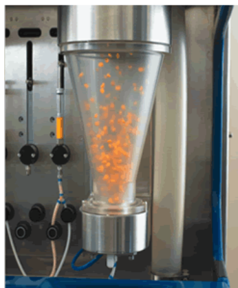
Figure 1. Tablet Movement

In the Supercell process individual batches of 15 to 100 grams of tablets or capsules can be coated co-currently with heated drying air. The tablets are rapidly rotated as they pass through the coating zone ensuring intimate contact with the coating material (Figure 1).