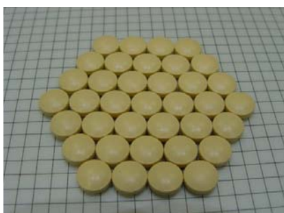
Figure 3. Coated Tablet Appearance (10% weight gain)

The coating process for each of the six trials ran smoothly with no difficulties. Visual examination of the tablets after coating revealed no signs of edge defects or other tablet damage. Edge defects were a concern due to random tablet impact with other tablets and various machine surfaces. The Acryl-EZE coated tablets exhibited exceptionally smooth and glossy surfaces (Figure 3).